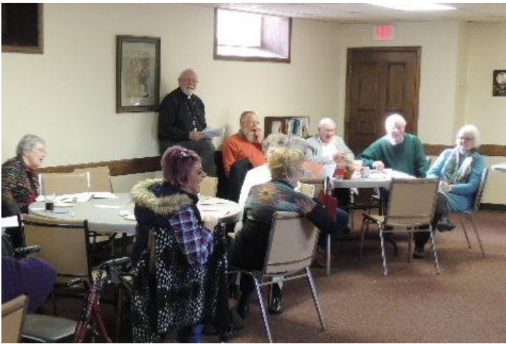
Fig 3. Annual meeting debates